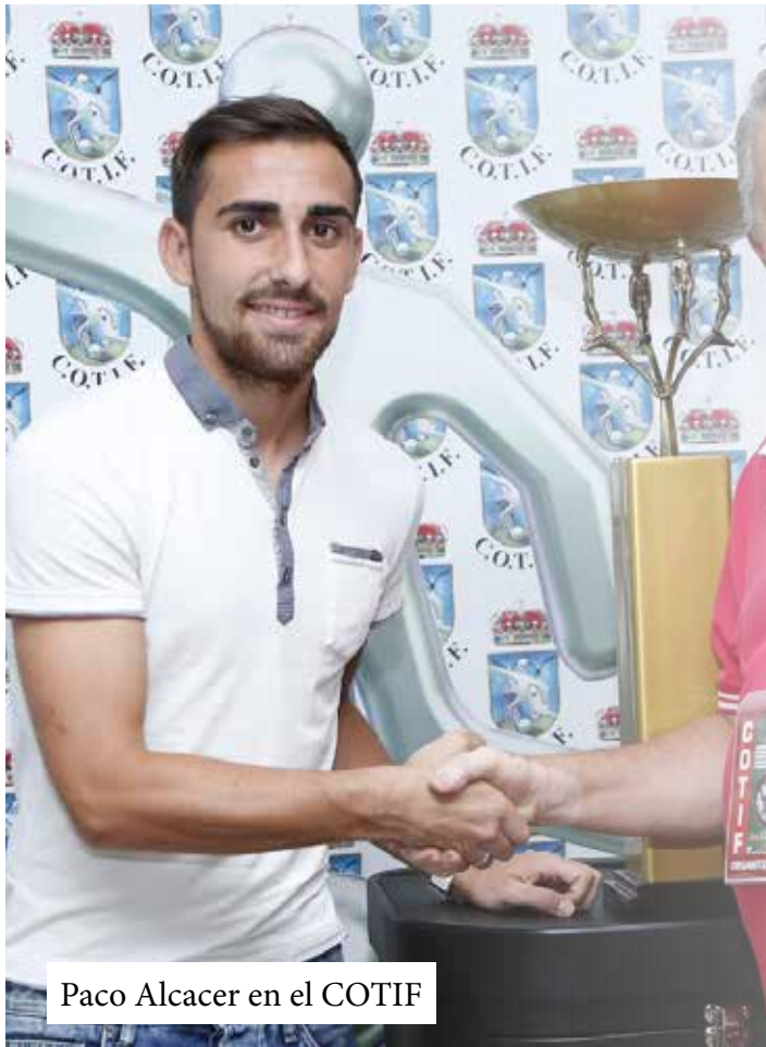
Paco Alcacer en el COTIF

4 – LENGTH OF MATCHES: Each match shall comprise two 40-minute halves, with a half-time interval of 15 minutes.